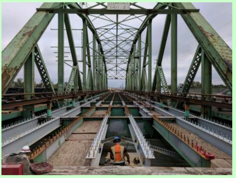
Steel repairs are complete on the historic green truss bridge on Santa Fe Avenue (US 50C), and work enters the final phase of construction.