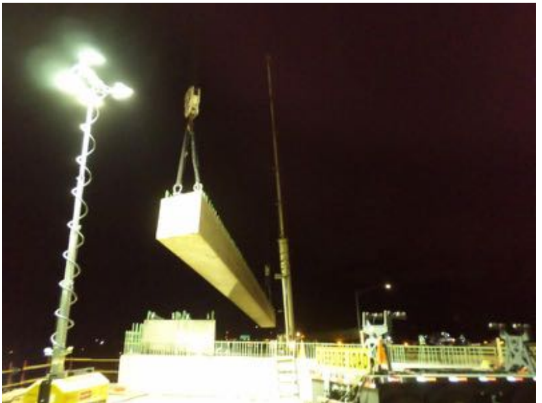
Cranes lifting girder into position

Once set in place, but before the crane's cables are removed, the team braces the girders so they do not shift or fall. The crane is unhooked from the girder, and moves to pick up the next one.